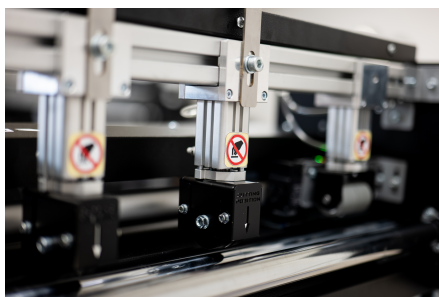
Pneumatic vertical blade