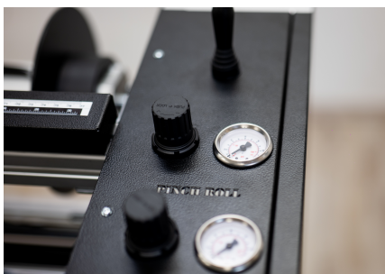
Adjustable pression for pinch roll and vertical blade