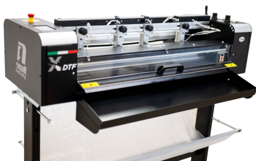
Copy collection tray

XY DTF is the game changer cutter that will transform your dtf production, and make it fully automatic.